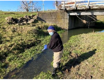
eDNA test at Wairoaiti Stream

The local councils have done dozens of these tests all around the catchment, so have all that information to guide their programmes.